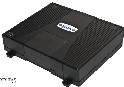
onBoard™ Mobile Gateway (oMG)

Some of the winning features that distinguished the In Motion product from its competitors were: